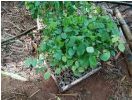
action Seedlings for planting