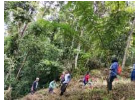
MFWDEU Members in